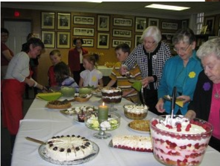
Snapshots from different well-attended events in and for the church during the winter and early spring.